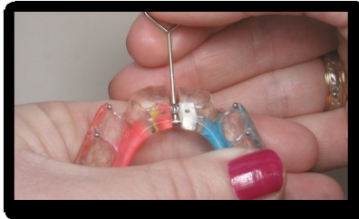
Place key in the top hole