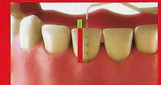
Expected results after TwinLight™